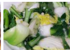
Stir Fried Asian Greens with Garlic