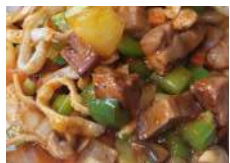
Pork Tiki Tiki