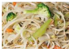
Vegetable Chop Suey