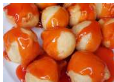
Sweet & Sour Chicken Balls