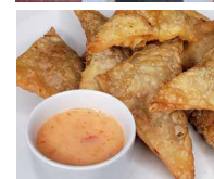
Chicken & Chive Fried Wontons