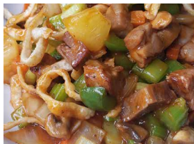
Pork Tiki Tiki