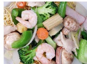
Tang's Chow Mein