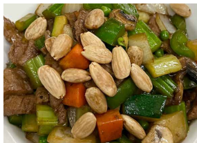
Almond Beef Ding