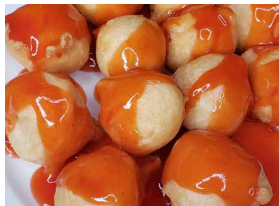
Sweet & Sour Chicken Balls