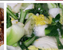
Stir Fried Asian Greens